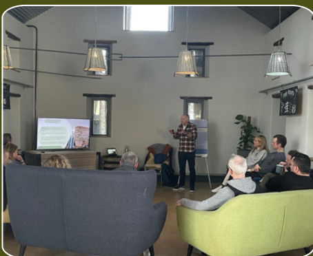
RELAXED MEETING SPACE